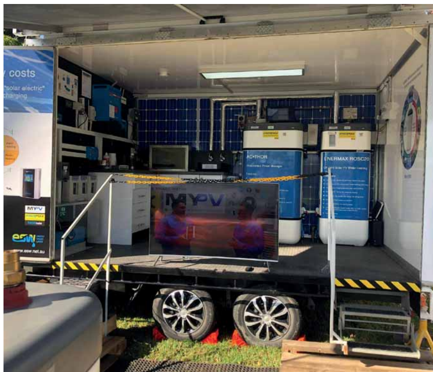
The Energy Smart Water training trailer is fully equipped with working systems.

The plumbing industry needs to be aware and familiar with this significant change in consumer expectations and system function.