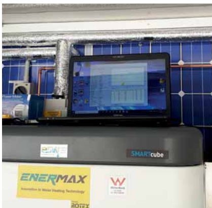
The trailer’s functional displays are all part of a ‘hands-on’ approach to learning.

As the Energy Smart Water training trailer visits regions, it will also be available to see and experience at various locations, including local TAFE facilities and community centers.