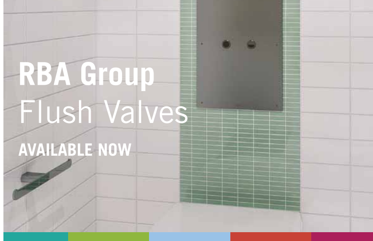
'Nautilus' Dual Flush Valve Incl Large Mounting Plate

This process creates full suspension combustion which is opposite to incineration where waste can sit on a grate