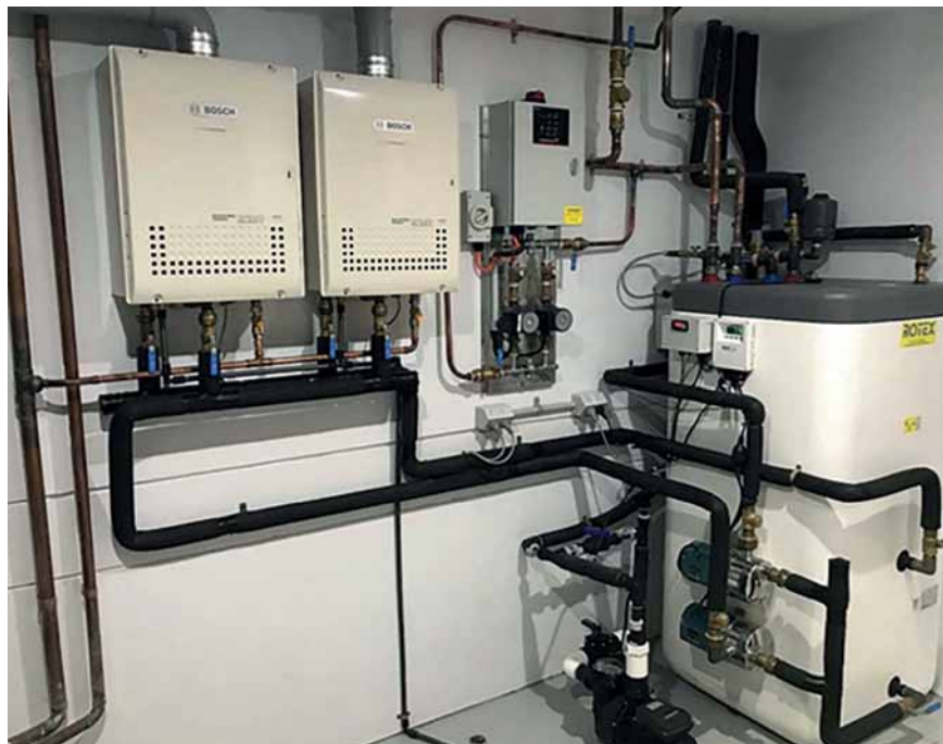
Typical residential dwelling Rotex system providing for DHW, mechanical heating via floor coils and pool heating from the single plant.

To gather energy and have it held for consumption can be achieved using a Rotex tank system which provides the integral ability to use multiple stainless-steel coils to transfer captured heat and distribute for DHW, mechanical heating