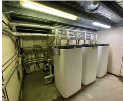
A typical Rotex commercial system installation.

For many years, a Rotex tank has been connected to a gas continuous flow unit to act as the primary energy source. But as expectations of energy