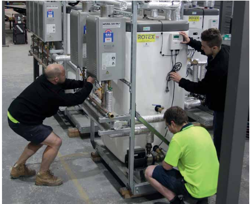
Licensed plumbers are employed to assemble and build the plant packages that are shipped to job sites all over the country.